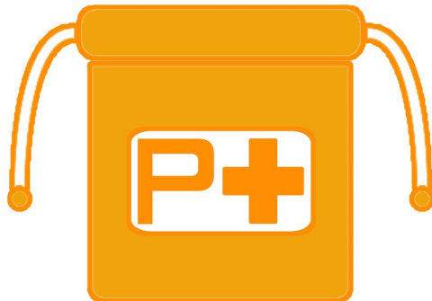
WATERPROOF DRY BAG