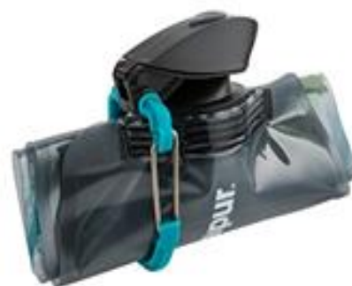
HYDAWAY Collapsible Water Bottle