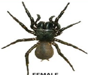
FEMALE SYDNEY FUNNEL - WEB