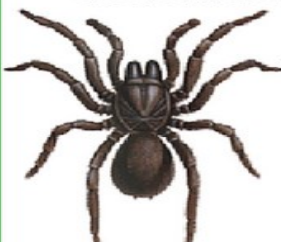
FEMALE TRAP - DOOR

SPIDERS CAN BE BENEFICIAL IN THE CONTROL OF MOSQUITOES & FLIES OUT IF THEY PRESENT A DANGER