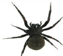
COMMON BLACK HOUSE SPIDER