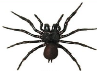
MALE SYDNEY FUNNEL - WEB