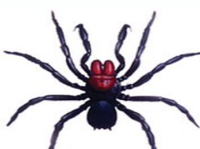
MALE MOUSE SPIDER