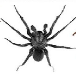
MALE TRAP - DOOR