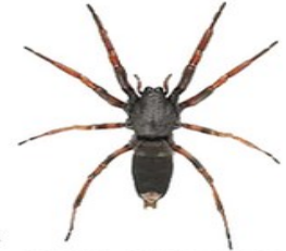
WHITE - TAIL SPIDER

NOTICE: MALE SPIDERS HAVE A SMALL ABDOMEN, LONGER LEGS & SWOLLEN PALPS