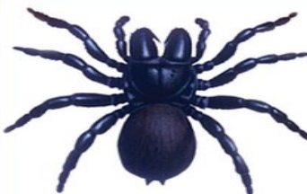
FEMALE MOUSE SPIDER