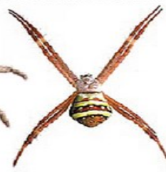
SAINT ANDREW'S CROSS