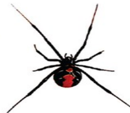
RED - BACK