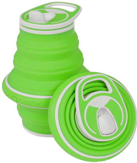
HYDAWAY Collapsible Water Bottle

Being a geek and gadget person I'm (as well as many other CERT members) always looking for cool & useful stuff.