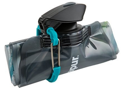
Vapur Element Bottle

There are dozens of varieties making it easy to find one that fits your needs and tastes easily