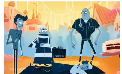
The Until Help Arrives Interactive Video challenges viewers to help virtual accident victims.

The You Are The Help Until Help Arrives program can educate you on how to take action in emergencies. A multi-agency effort led by the U.S. Department of Health and Human Services Office of the Assistant Secretary for Preparedness and Response (ASPR) and the Medical Reserve Corps (MRC), the Uniformed Services University's (USU) National Center for Disaster Medicine and Public Health (NCDMPH), and the Federal Emergency Management Agency's (FEMA) Individual and Community Preparedness Division (ICPD) developed the base of the program.